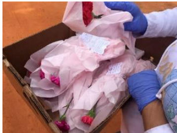
Local Mothers' Day Outreach