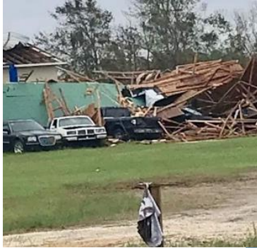
A special thanks to Real Live

The end of 2020 was a whirlwind of local relief work, and teaming up with Anchor Point to, once again, provide for their Christmas, along with taking toys and supplies to